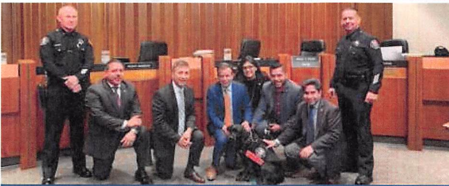
Santa Ana City Council Meeting