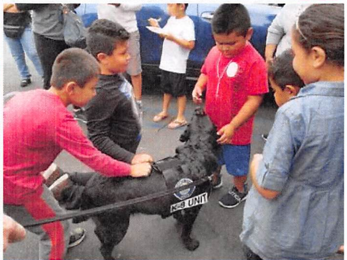
Carne Asada with a Cop

and this initiative has been met with an overwhelming show of support. However, we have found two additional opportunities for Shadow to not only interact with our employees, but the community as well. Those two areas are juvenile victim interviews and Community Engagement events.