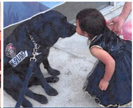
National Coffee with a Cop

As an industry, we have tried to think of new and innovative ways to combat the ever-increasing number of suicides by police officers. Employee wellness programs have been implemented by agencies and departments across the country. These programs have diverse goals such as increased morale, improved recruitment and retention of employees, reduced absenteeism, and building camaraderie among coworkers.